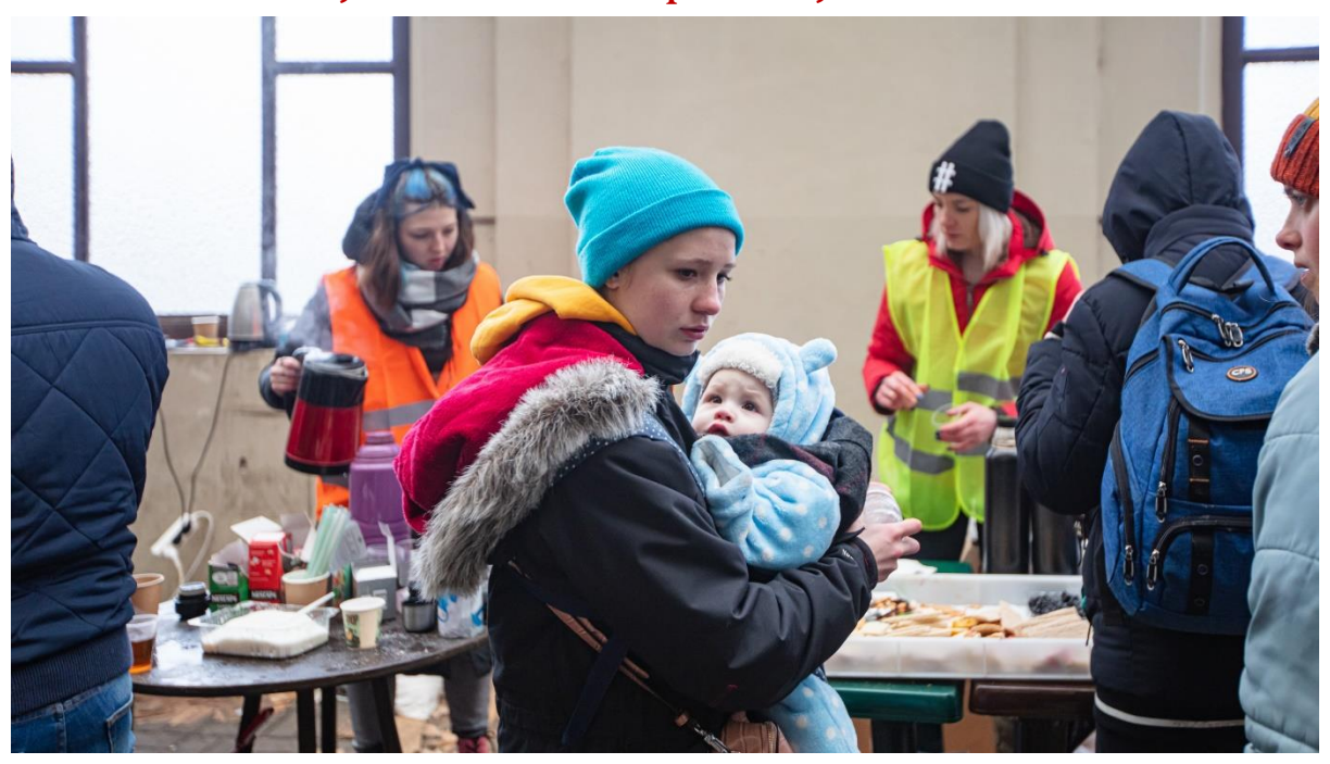
https://www.socialists and democrats.eu/newsroom/sds-ukrainian-women-fleeing-war-must-not-fall-hands-traffickers