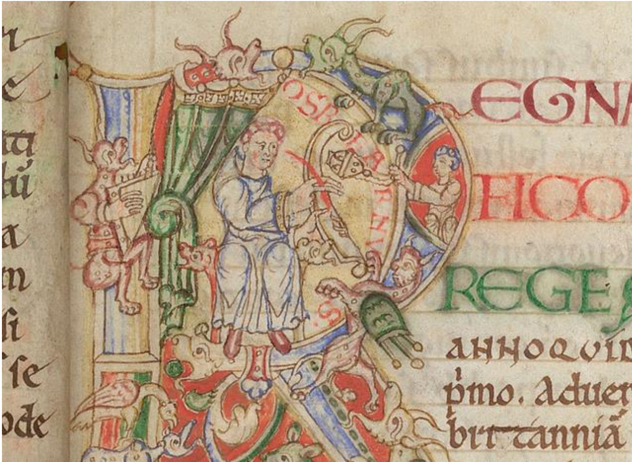
Manuscript of the life of Alphege made at Canterbury shortly after his death (BL Arundel 16, f. 2)

Alphege became a monk at Deerhurst near Gloucester. In later life he withdrew to become a hermit in Somerset. In 984, the Archbishop of Canterbury, Dunstan, drew him back to become Abbot of Bath and Bishop of Winchester. In 1005 he became Archbishop of Canterbury, where his austere life and lavish almsgiving made him a revered and much-loved man.